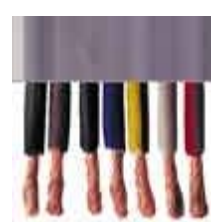
Ecofil i 7 x 2.5 mm 2

automation by introducing the bus part, the data section which receives control commands compatible with EIB, LON, Twiline, Luxmate and Batibus technologies.