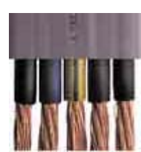
Ecofil i 5 x 16mm 2