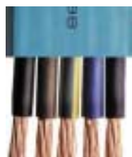
Ecobus Power 5 x 10 mm 2

Woertz has characterized the flat cable systems for building