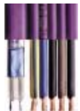
Ecobus Combi 5x2.5mm 2 + 2x1.5mm 2